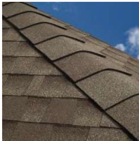
After A distinct finishing look that also protects against leaks and shingle blow-offs